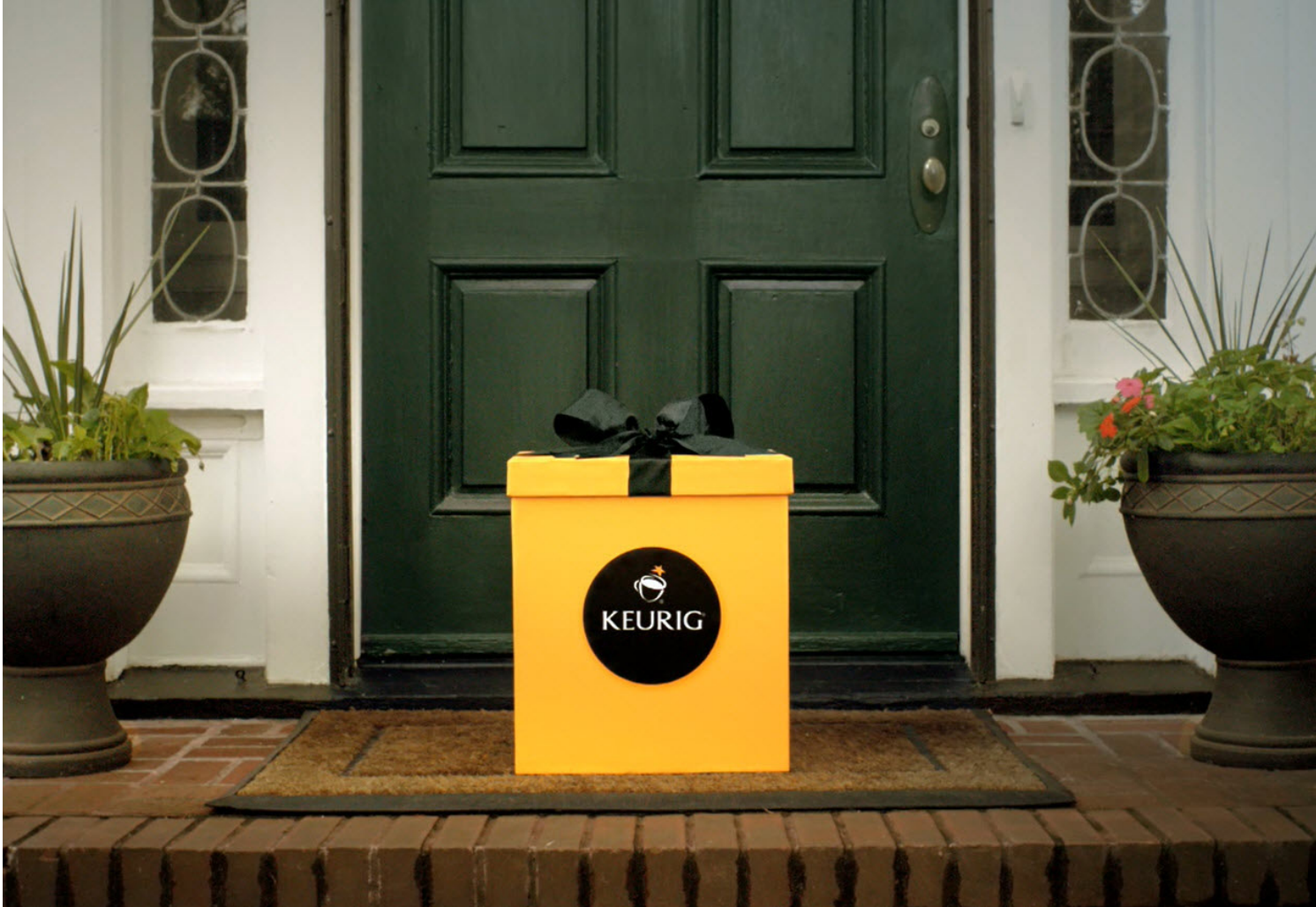
ABOVE Keurig's current campaign, Brew the Love, emphasizes how a warm cuppa can bring people together.