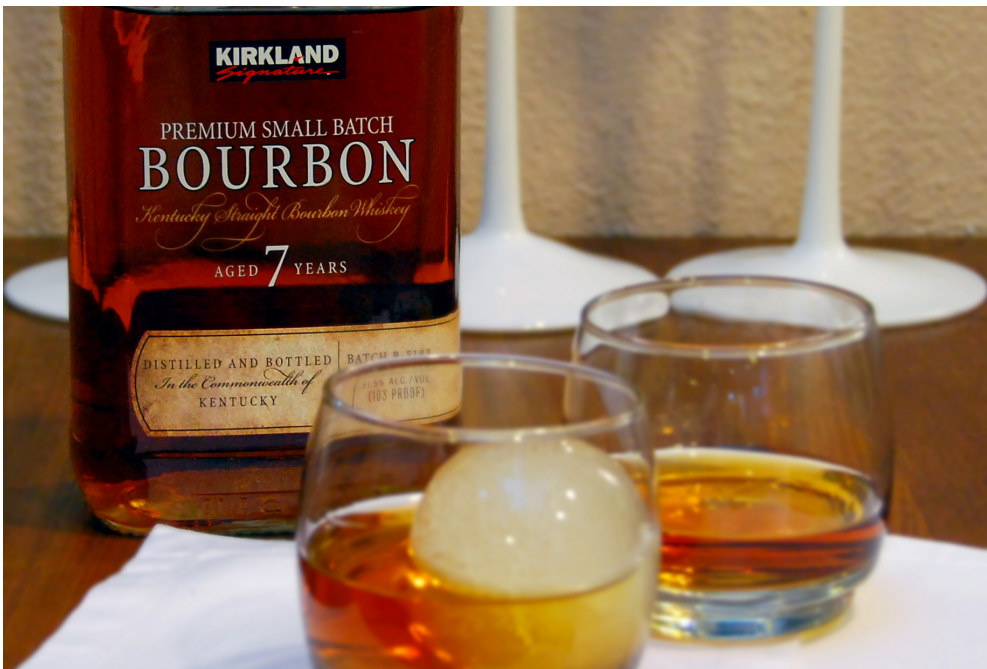
LEFT A significant product line increase means the Kirkland Signature wordmark now graces items from bourbon to swimsuits.