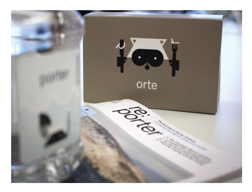
Porter's core business may have little to do with design, but it permeates all touchpoints regardless

Additionally, those who follow design have likely noticed that Canada does not generally provide the support that would allow many of these designers to work locally and flourish in our market. So many take their talents elsewhere – places where their craft is perceived as valuable and rewarded accordingly. Some rationalize that Canada's relatively small market size is to blame for its lack of investment in the arts, but with sufficient industry and government support, design can thrive in smaller markets like Canada. The Netherlands is a prime example.